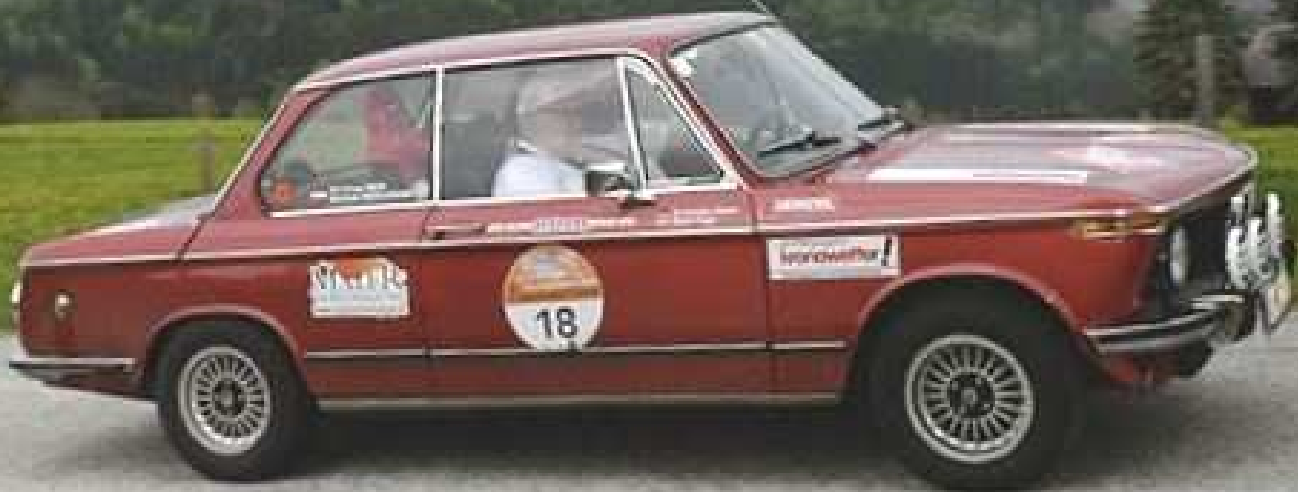
KR Hugo ROM, BMW 2002 ti, Sieger des KCC 2018 und, Kärntner Classic-Meister 2018